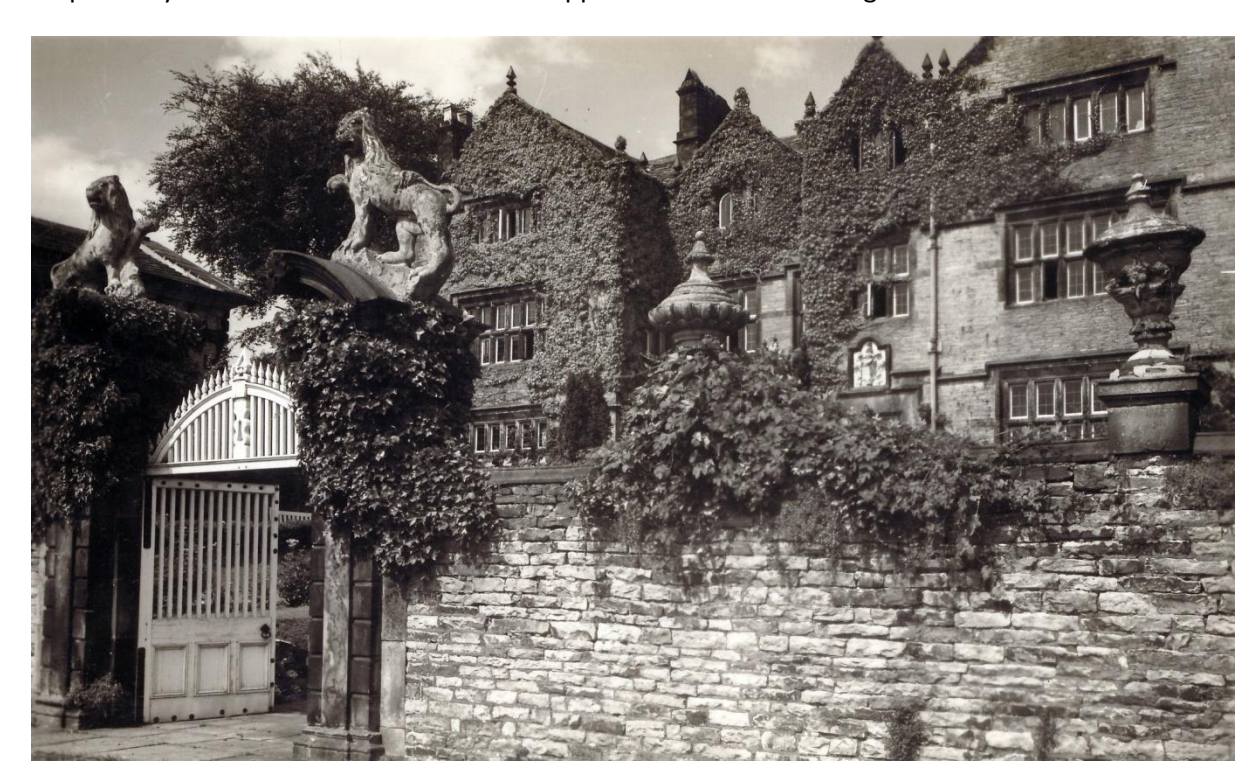
Photograph of the front of Kildwick Hall, showing the Currer lions. The lions are reputed to walk down to the river and drink whenever the church clock strikes 13.

Itis probably around this time that the lions appeared above the front gates of the Hall.